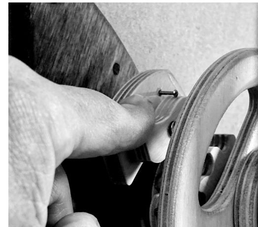
Ratchet pawl mentioned in winding section